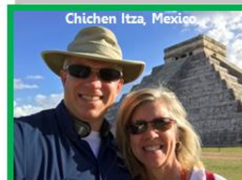
Chichen Itza, Mexico