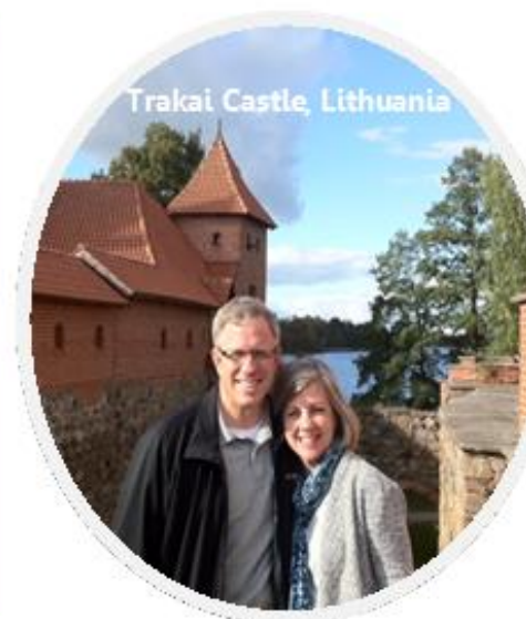
Trakai Castle, Lithuania