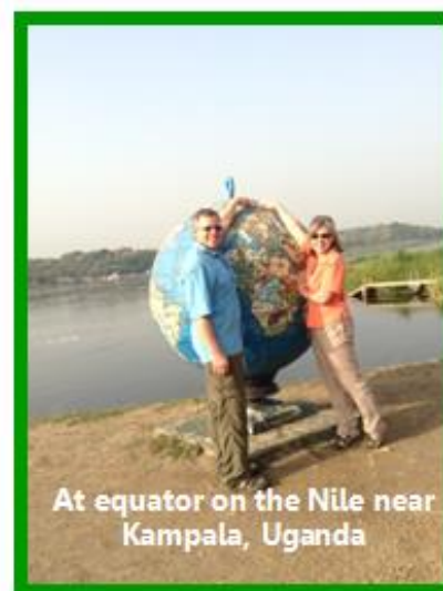
At equator on the Nile near Kampala, Uganda