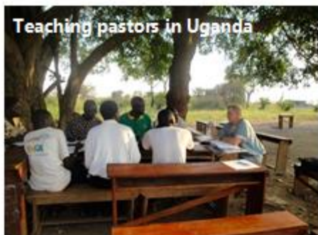
Teaching pastors in Uganda