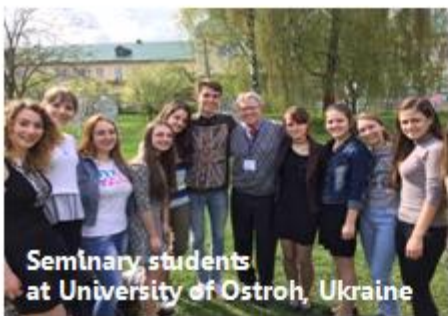
Seminary students at University of Ostroh, Ukraine

"I am passionate to glorify and enjoy God by using my spiritual gifts and core competencies for leading and inspiring deeper discipleship among His people so that they will make an impact for Jesus in their local area and as part of the global church. "